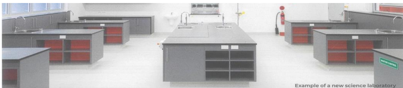
Example of a new science laboratory